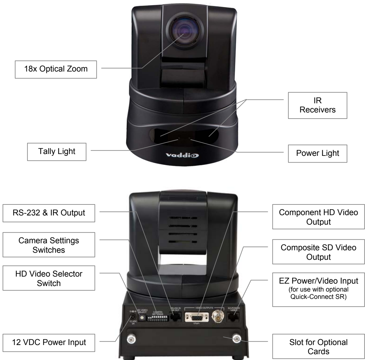
Figure 2: ClearVIEW HD-18 front and rear diagrams with functional callouts.